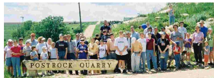
Western Kansas Safari: We explore the unusual chalk used for fence posts in earlier days. Even the sign at Post Rock Quarry is full of fossils.