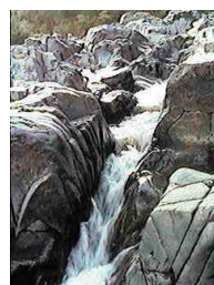
Southeast Missouri/Johnson's Shut-ins This picture does not begin to tell the story of the "swimming holes" at Johnson's Shut-ins. Many water holes, slides, falls and pools in crystal clear water make it an experience that will be difficult to forget. Where did these granites and rhyolites come from, how did the "erosion" occur?