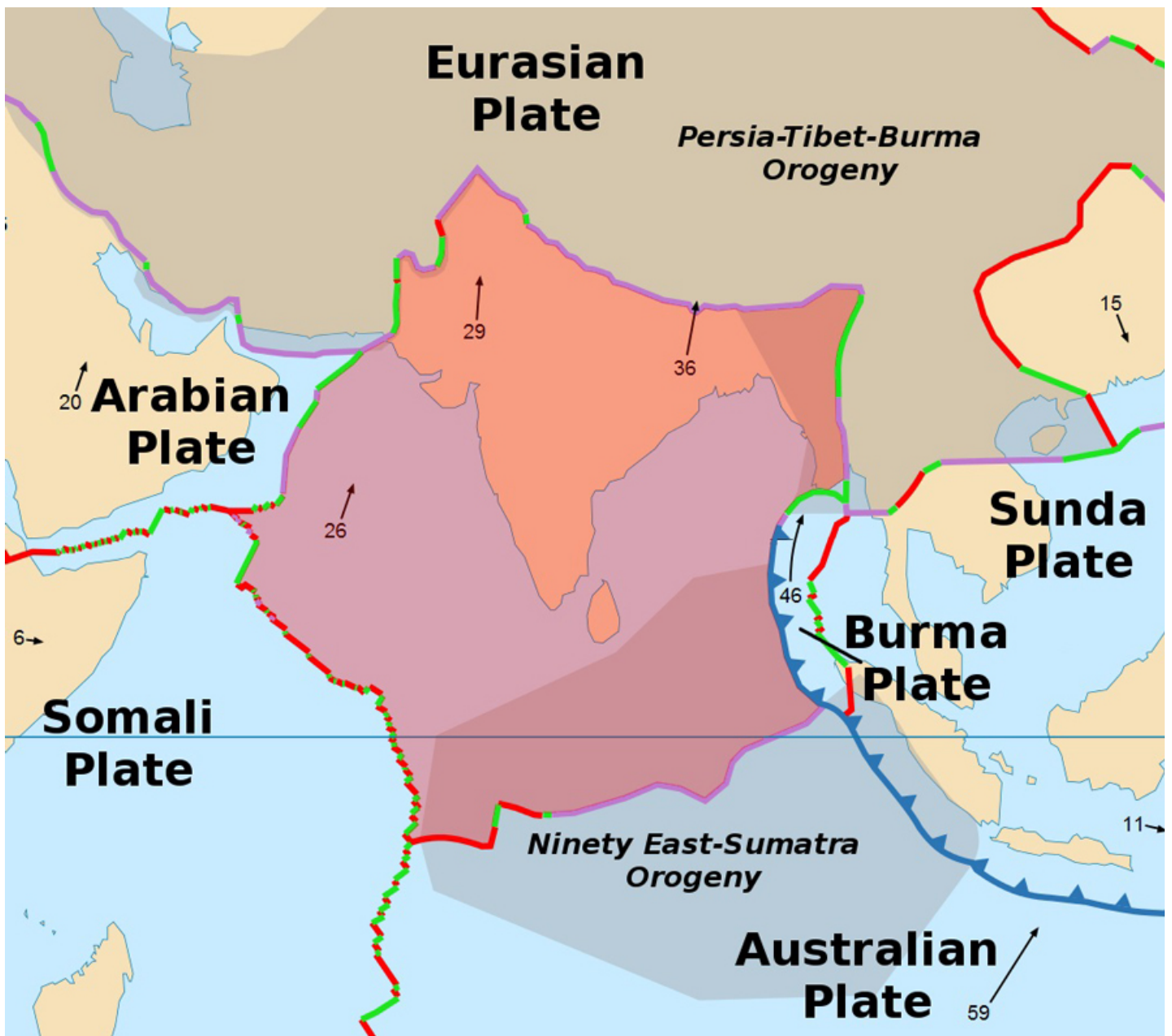
Tectonic plates in south Asia. 3

After I wrote the first draft of this article on May 5th, there were numerous aftershocks and tremors in many locations around the world, but primarily in the Himalayan mountain range. The second major quake occurred on April 25th at 11:56 A.M. NST (06:11:26 UTC) at a depth of approximately 15 km (9.3 miles), which is considered shallow and therefore more damaging than quakes that originate deeper in the ground. 4