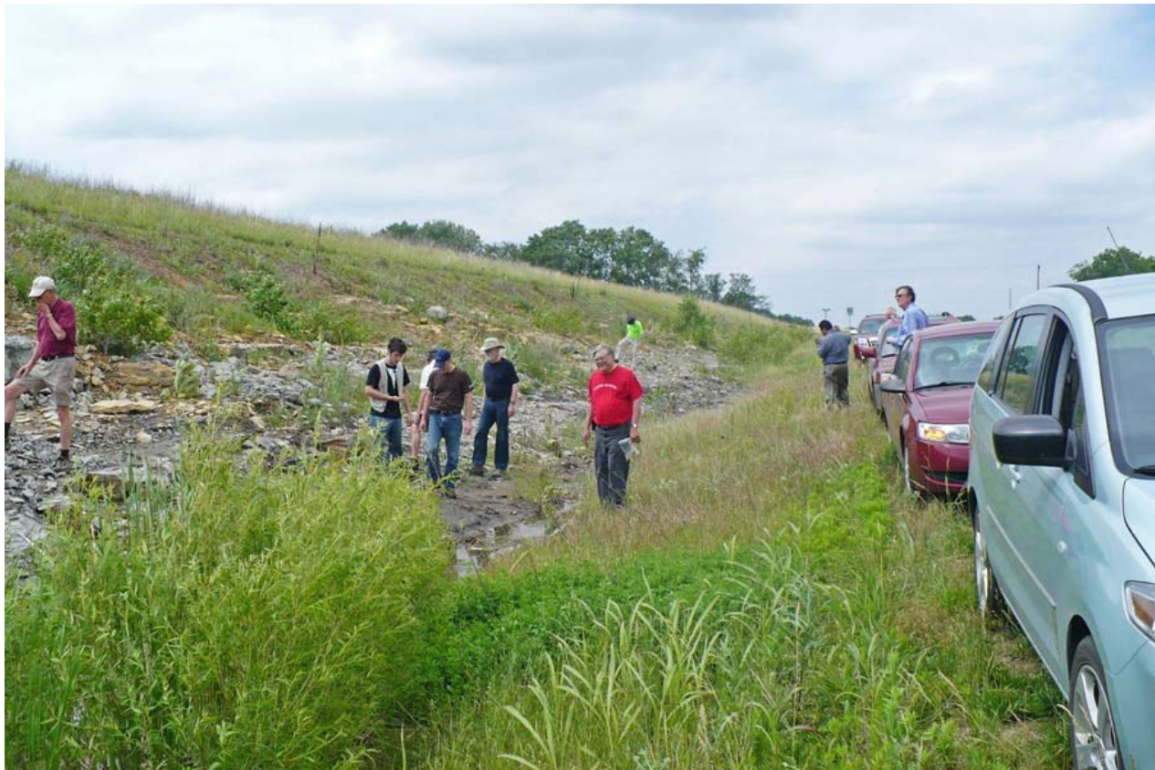
CRS Board fossil hunting.