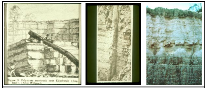
L to R, Top: Edinburgh, UK; Germany; New Castle, Au. Bottom: Kentucky, USA; Yellowstone, USA; St. Etienne, Fr. For popscience history to be true, each of these trees stood erect without roots or limbs for at least 900,000 to 3 million evolvo-years!

On every continent, trees are found, well preserved, typically with no roots or limbs, protruding through as many as 20 or 30 feet. These "polystrate" (many strata) trees would have to stand erect without limbs or roots for 30' x 12" x 8333 yrs/inch = 3 million years! But, in the field, it is much worse than this. Trees have been discovered which protrude through half or more of the entire fossil-bearing portion of the so-called "geologic column," up to 275 million years! (That I know of, there are probably known cases much worse.)